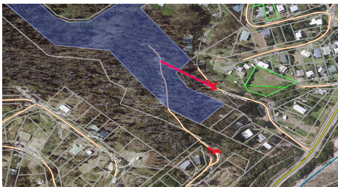
(Figure A: Map of Stanway Drive, Wye River)

The constructed road within the Subject Land is shown on the plan below (in the area shaded blue) at Figure A.